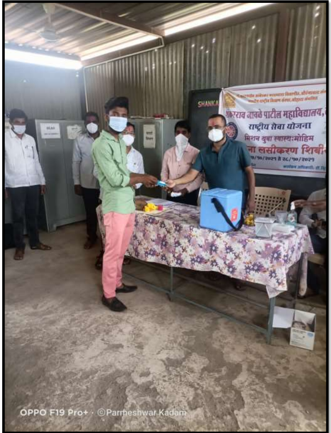
Distribution of Mask and Sanitizer to Students