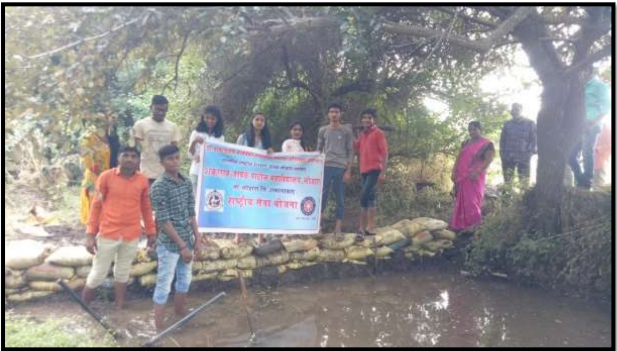
NSS volunteers constructed Vanrai Bandhara at Malegaon during the Camp