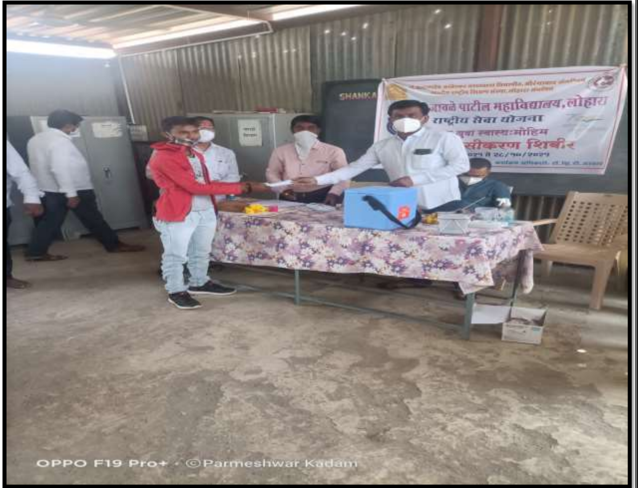
Distribution of Mask and Sanitizer to students