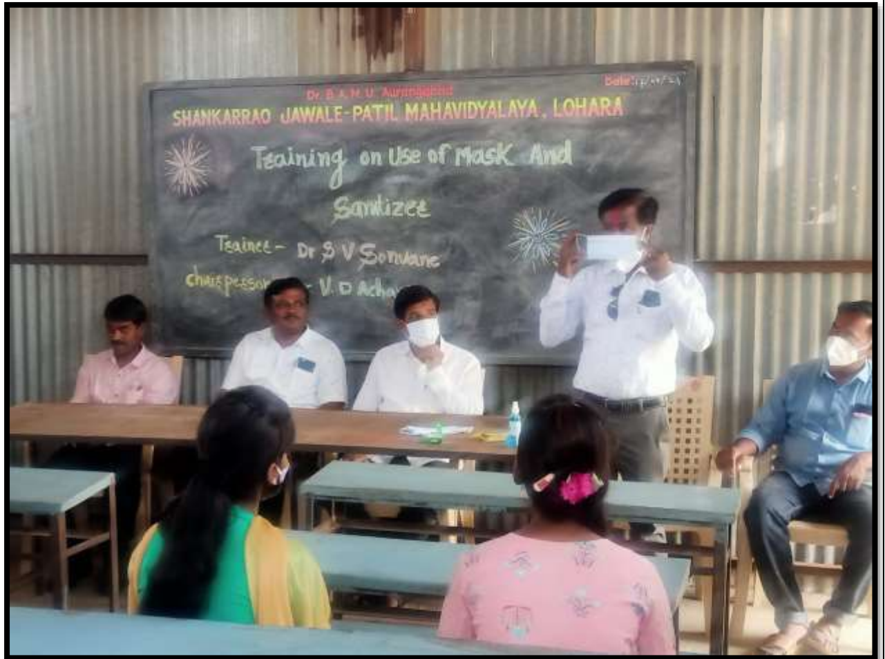
Training on How to use Mask and Sanitizer